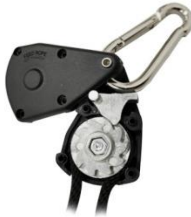
Built-in metal pulley