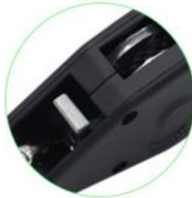
Built-in metal pulley